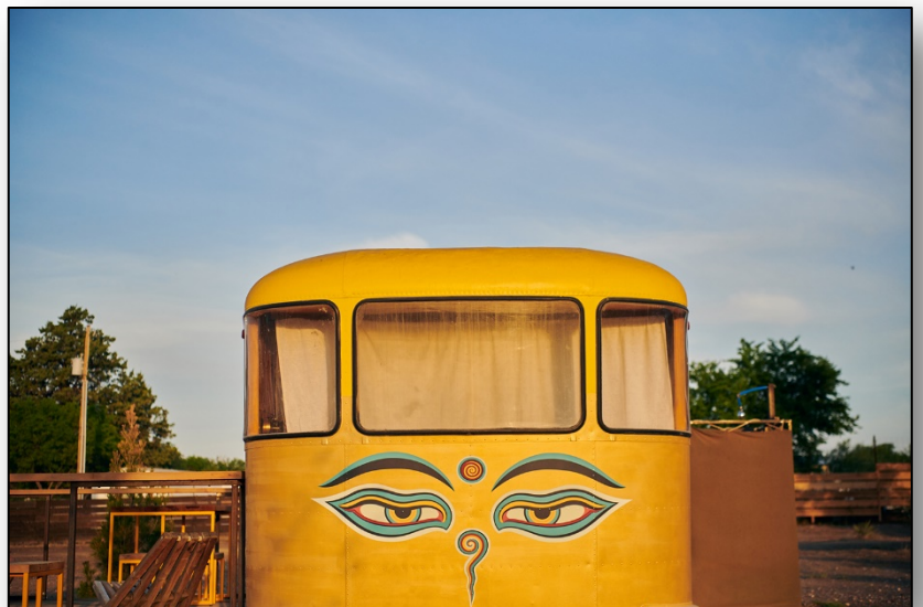
El Cosmico. Marfa, TX

**** We recommend bringing food, snacks and a lot of water for Saturdays & Sundays. Meals are not included (although we will likely have food to share & hopefully we can have a potluck style table set-up throughout these days). It is recommended to eat lightly during the yoga training days anyway and it will save time and energy to come prepared.